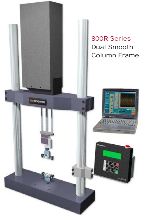
800R Series Dual Smooth Column Frame