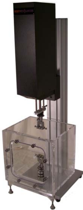
100R Series Single Column Frame Biomedical Bath