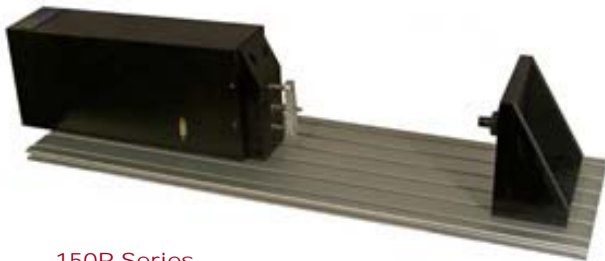
150R Series Horizontal Test Tables