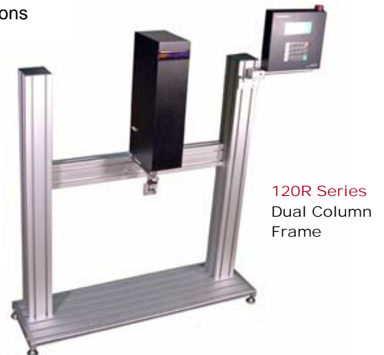
120R Series Dual Column Frame