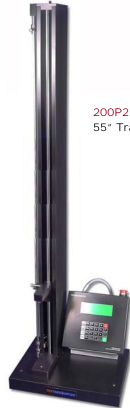
200P225-55 55" Travel