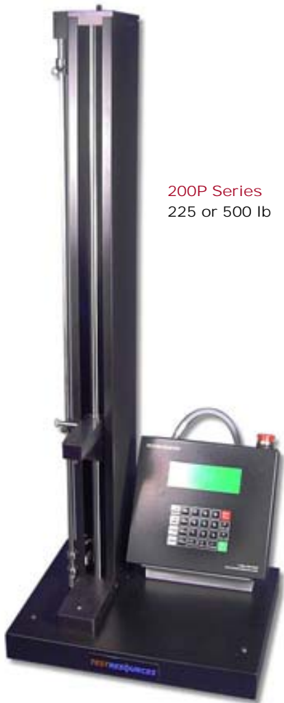
200P Series 225 or 500 lb