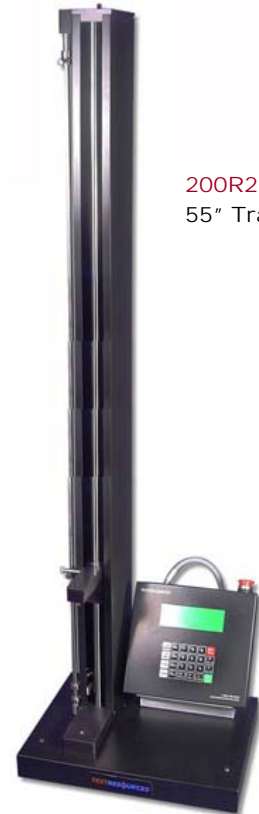
200R225-55 55" Travel