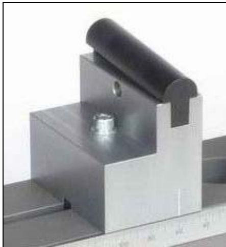
J22G anvil - ensures forces applied are initially perpendicular to the specimen surface and are applied without eccentricity.

G22 bend fixtures include a series of accessories, anvils, and configurations for special applications.